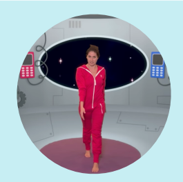
Blast off the right way with this Cosmic Kids rockets & space yoga.

Check out the next page for ... Sporting Influence's Great Game Collection