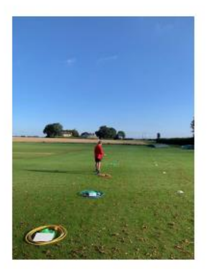
Outdoor Adventurous Activities